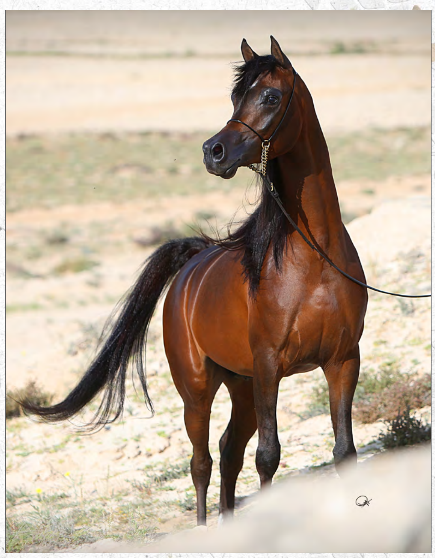
Wadee Al Shaqab (Marwan Al Shaqab x OFW Mishaahl)