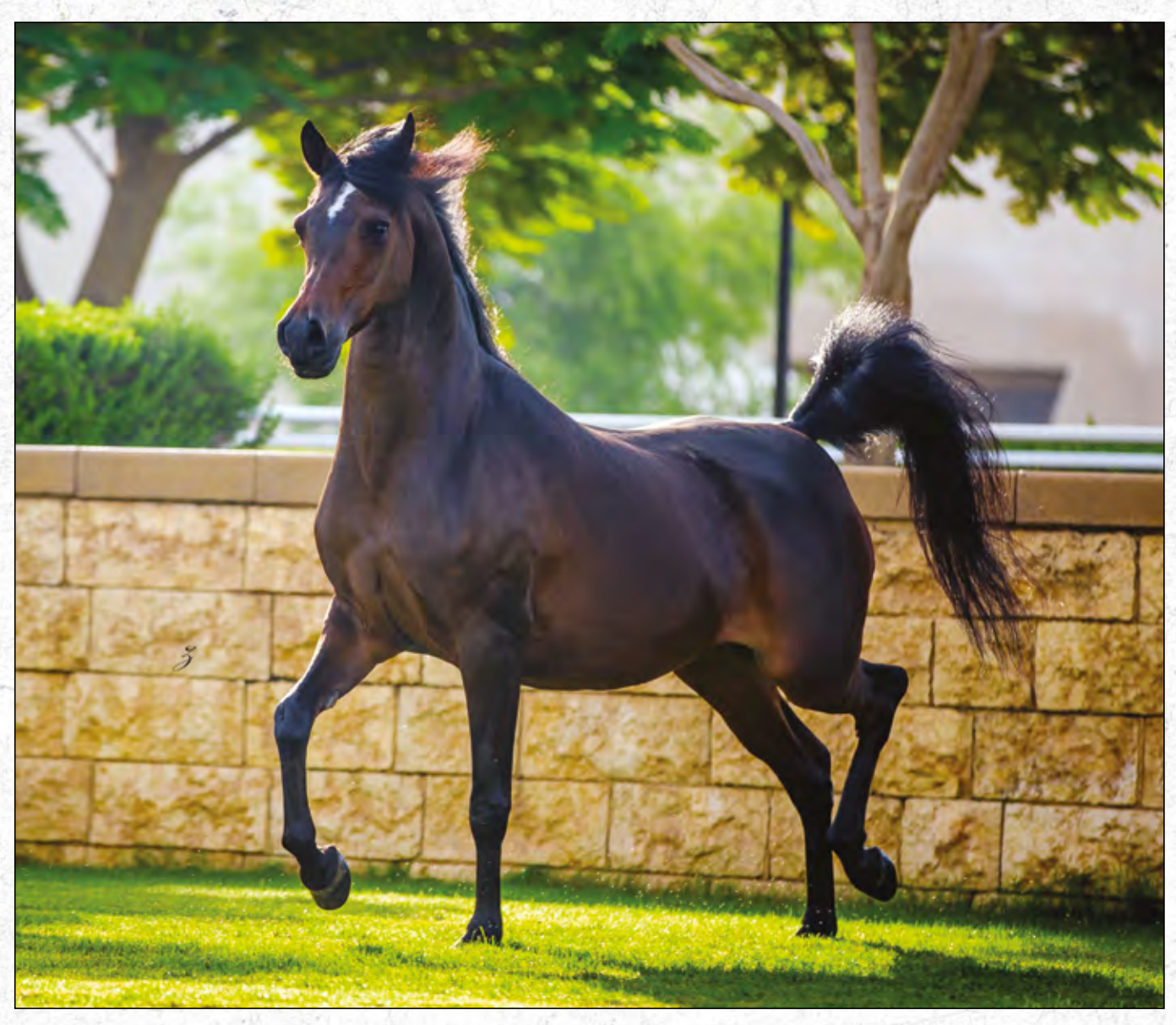
OFW Mishaahl (Mishaah x OFW Balarina)

was World Champion both as a junior colt and as a senior stallion as well as the 2018 Platinum World Champion Male.